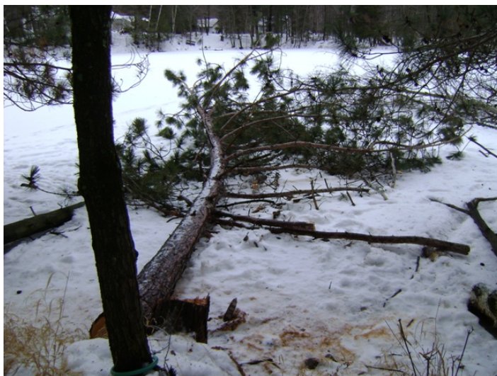
Once a tree is felled and secured to the shore it becomes a "Fish Stick" to provide fish habitat.

Fish sticks are single trees or groupings of trees that are placed in the lake near the shoreline and are securely connected to a tree stump or other anchor point on the shore. These trees provide valuable near-shore