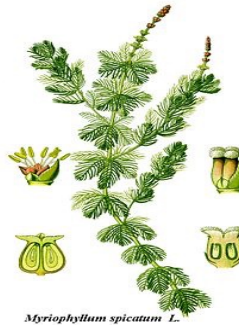
Myriophyllum spicatum L.